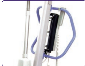
Over-sized push handle for improved handling and manoeuvrability.