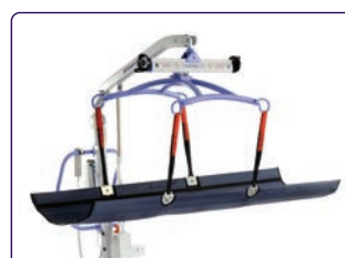
6-point adjustment cradle for use with a stretcher