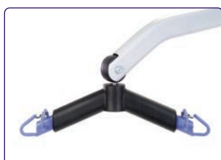
6-point spreader bar

The Presence can also be fitted with an optional digital weigh-scale device providing an accurate measurement of weight for on-going patient observation. This weigh-scale is extremely compact and has a dual screen display for ease of use.