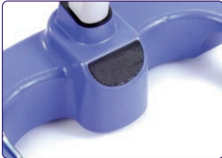
Foot 'push pad' helps reduce the force needed to initiate forward movement.