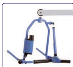
Manual or powered 4-point cradles