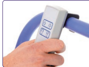
Hand control clip ensures convenient storage when not in use.