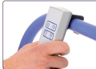
Hand control clip ensures convenient storage when not in use.