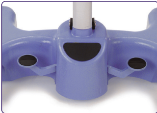
Foot 'push pad' helps reduce the force needed to initiate forward movement.