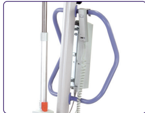
Over-sized push handle for improved handling and manoeuvrability.